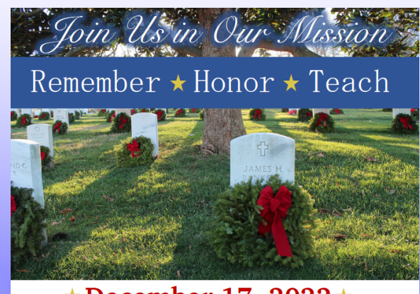
★ December 17, 2022 ★ National Wreaths Across America Day

Please Help Choctawhatchee Bay Chapter, NSDAR by sponsoring a wreath today to be placed on a Veteran's grave this December at Beal Memorial Cemetery.